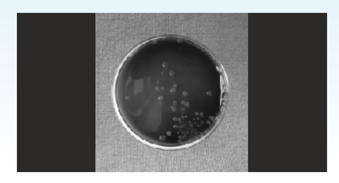
Fig 1 GROUP A