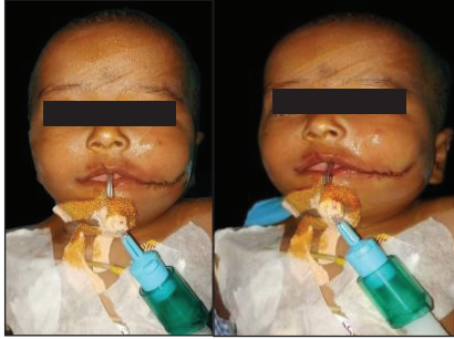
Figure 3: Postoperative photographs.

extends into the maxilla, affecting the bony structures of the upper jaw. This can cause asymmetry and deformities in the midface. Tessier 7 cleft can affect the development of teeth in the affected area, resulting in dental malformations and misalignments. The cleft may extend into the nasal structures, changing the shape and function of the nose. As a result of the structural abnormalities in the oral and nasal regions, people with Tessier 7 cleft may have difficulty speaking and feeding. Facial esthetics are severely impacted, necessitating comprehensive interventions that address both functional and cosmetic aspects. Various classification systems, including those by the American Association of Cleft Palate Rehabilitation, Karfik, Boo-Chia, Demeyer, and Van der Meulen, [1,2,4,9] exist, but Tessier classification, established through clinical analysis, is widely accepted. Hypoplasia is observed in the zygoma, temporal bone, maxilla, mandible, parotid gland, parotid duct, and innervation areas of the fifth and seventh cranial nerves, as well as the palate and tongue. [10] Numerous surgical techniques have been described, although the goal rectifications are the symmetrical shape of lip commissure, reestablishing oral sphincter, and quality of scar formed post z-plasty. This case yielded a satisfactory functional and esthetic result when visited for follow-up.