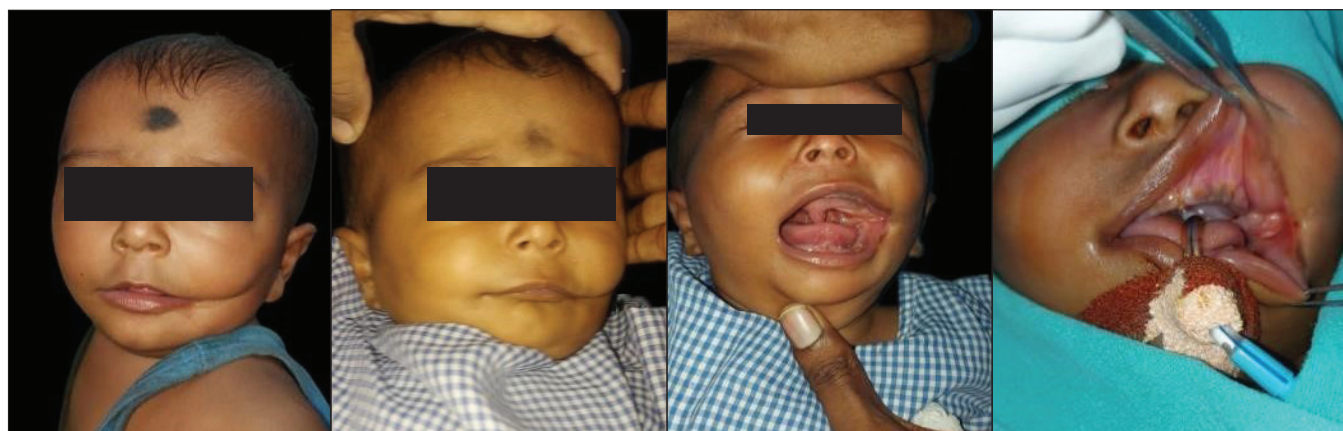
Figure 2: Preoperative photographs.

The transverse facial clefts are mostly male predilected, which tend to be on the left side. The clinical features of Tessier 7 cleft includes distinct manifestations in the affected facial region. Upper Lip Abnormalities: Tessier 7 cleft frequently results in a cleft of the upper lip, which can extend from a minor notch to complete separation. The cleft