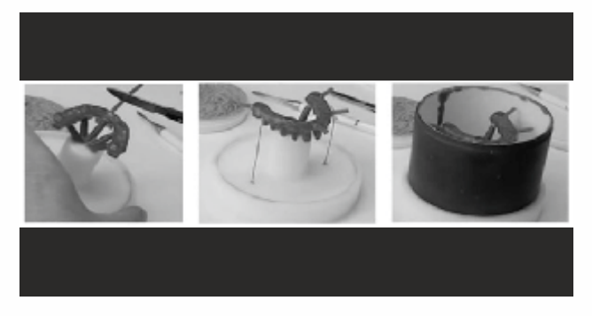
Figure-3 Moulded wax frame work

The PEEK molten material was injected within 60 seconds into the mould cavity with pressing pressure of 150 MPa. The cooling time for the injected PEEK polymer was 5 to 6 hours. The injected moulds were left overnight to allow slow bench-cooling to room temperature. The flask was then de-flasked and the specimens were cut from the sprues.