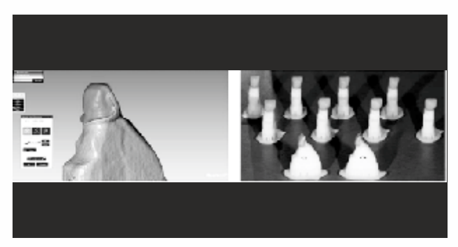
Figure-4 computer-aided design and fabrication of PEEK veneers.

fourteen high-performance polymer dental facets (PEEK) were developed using computer-aided design (CAD) software [Figure-4], then milled using a computer-assisted machine (CAM). PEEK granules by vacuum pressing or CAD-CAM milling are used as a framework for long span FPD which is finally layered with a nanocomposite. As PEEK is lighter, it may be a suitable alternative to chrome-cobalt ceramics. Furthermore, it does not corrode when in contact with other metals in the mouth. The resistance to breakage of PEEK fixed prostheses ground with CAD-CAM is higher than that of lithium disilicate glass-ceramic, aluminum, and zirconium.