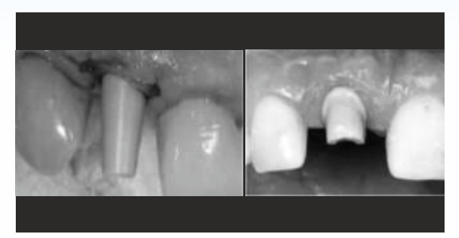
Figure -2 PEEK as abutment

the PEEK implant surface, studies have been made on hydroxyapatite (HA) coating. Promising results have been obtained from PEEK implants coated with HA in comparison with non-coated PEEK implants<sup>14</sup>. When current research is examined, it can be seen that there are still no long-term studies of the efficacy of this material on patients. Therefore, PEEK implants are not widely used clinically.