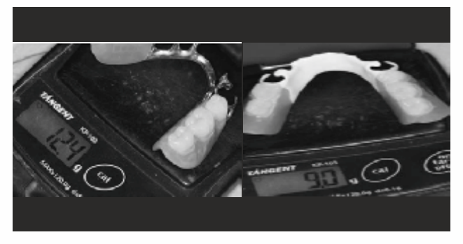
Figure-5 comparison of the weight of two partial dentures in cobalt-chromium and that in PEEK.

conventional metal and acrylic prostheses, as few published clinical studies or systematic reviews have focused on the use of PEEK as a denture material. Nevertheless, given the superior mechanical and biological properties of PEEK, dentures constructed from this polymer could well be routinely constructed in the near future. The low weight and the absence of allergy are assets boasting the merits of using PEEK (Bio-HP) as an alternative to chromium-cobalt in the realization of partial denture<sup>26</sup> has carried out in the same patient a PAPC in chromium -cobalt and a second PEEK, the weight of the latter is 27.5% smaller than that of the first [Figure-5], even if the configuration is modified (cobalt chrome lingual bar against a lingual PEEK headband) stresses that PEEK partial dentures compared to acetal ones require a biomechanically balanced design to ensure periodontal durability<sup>30</sup>.