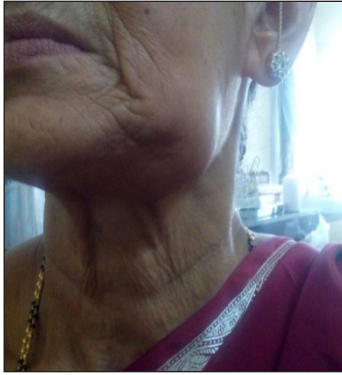
Figure 1: Photograph showing swelling on the left side of the neck.