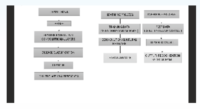
Figure 1. Shows Deep Learning system process, for feature extraction and classification of oral diseases, and in the recognition of patients affected with SS, that is volume of data sets should be trained and input is received by the convolutional neural networks, to create a learning model. Test data should be fed into the learning model to evaluate each image for the SS characteristic features.

fed into the multi-layered neural network, thereafter system performs step wise learning by means of supervised or unsupervised learning programs and extracts the characteristic features from the data set, that is auto segmentation, to create automated learning model [Figure 1].<sup>8</sup>