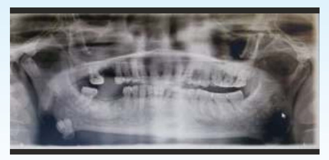
Panoramic radiograph showing a tooth like structure located at the angle of mandible.

Further was investigated with Cone Beam Computed Tomography (CBCT) that has shown tooth morphology like structure at the angle of mandible of size approx. 18x 8.5 mm lingually 6.3 mm away from mandible suggestive of ectopic distomolar.