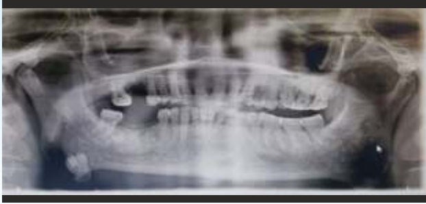
Panoramic radiograph showing a tooth like structure located at the angle of mandible.

Further was investigated with Cone Beam Computed Tomography (CBCT) that has shown tooth morphology like structure at the angle of mandible of size approx. 18x 8.5 mm lingually 6.3 mm away from mandible suggestive of ectopic distomolar.